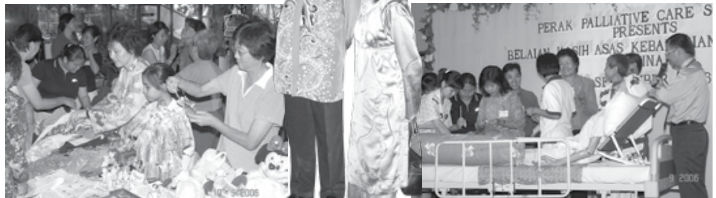
Handicraft work on charity sale